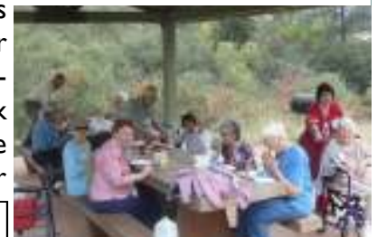
Field trip in Oak Creek Canyon

With the increasing number of participants and growth of the transportation program, SSCA realized the need for a new van. The dream for this new wheel chair lift van became reality with the awarding of the ADOT/NACOG grant. SSCA must raise $7590 as a stipulation of the grant, but having a dependable vehicle is priceless.